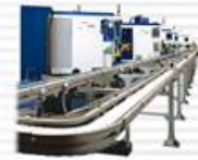
AUTOMATIC LINE FOR PISTONS